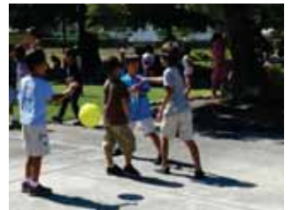
Kids at play

This week has been a lot of fun in Undokai. The kids have enjoyed playing games, like soccer, capture the flag, dodgeball, beanbags, and of course everyone's favorite; splashball tag. This class allows the kids to have a good time playing outside while also staying active. Throughout this week I've witnessed all of their competitive sides, their teamwork abilities, and their skills in each of the different activities. It's been a pleasure so far to work with everyone and, I'm looking forward to another exciting week!