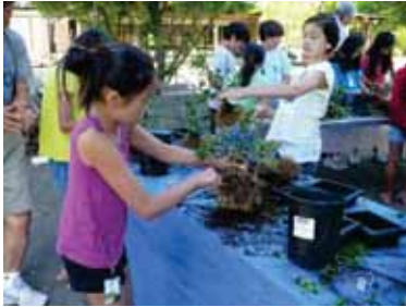
Tora students trimming and potting a bonsai tree.