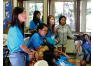
Ryu students listening to last minute instructions before their field trip.

Link to Japanese Art and Cultural Center (anime class): http://www.jpnants.org