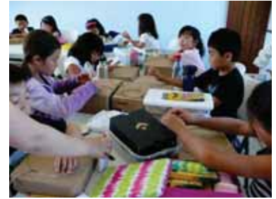
Kuma students are working on a sumo wrestling game.